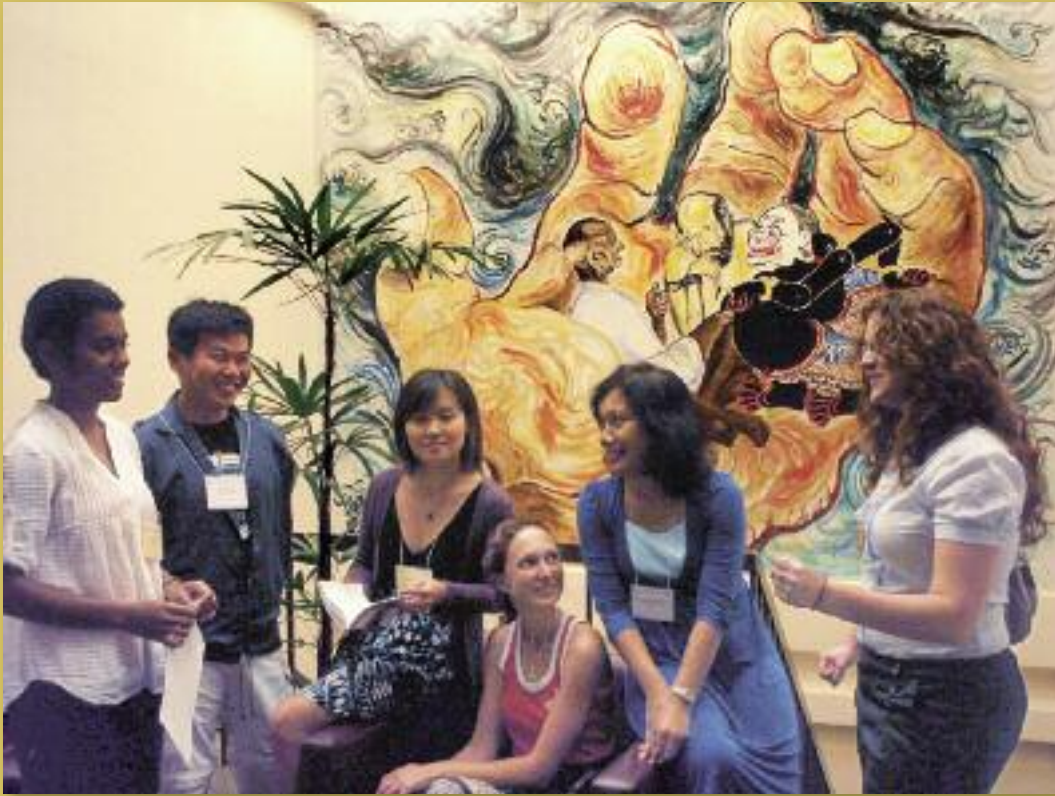
At the International Graduate Student Conference, EWC student fellows from Fiji, Indonesia, Mongolia, and the U.S. discuss regional issues in front of the newly restored "Wisdom of the East" mural by Javanese master painter Affandi, part of the East-West Center's Permanent Collection.