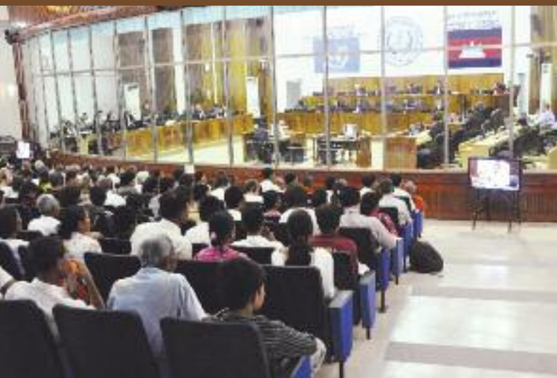
Photos above and left: Courtesy of the Extraordinary Chambers in the Courts of Cambodia