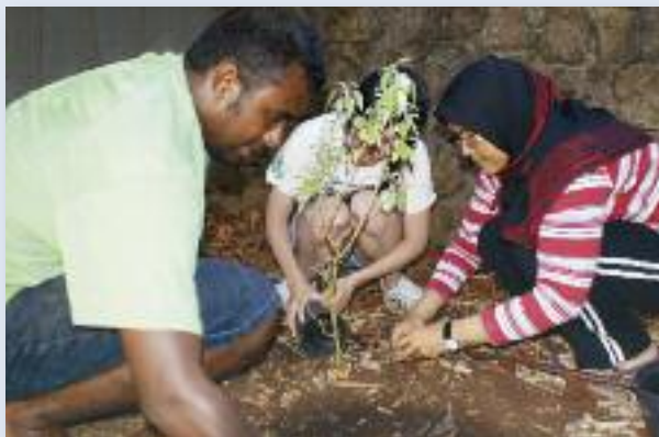
USIE participants help offset the carbon footprint of their international flights by planting trees at the University of Hawai‘i Environmental Center.

Funded by the U.S. State Department’s Bureau of Educational and Cultural Affairs, USIE was organized and administered by the East-West Center in collaboration with more than twenty organizations including the University of Hawai‘i’s Environmental Center, Stanford University’s Woods Institute for the Environment, and the Nature Conservancy. ♦