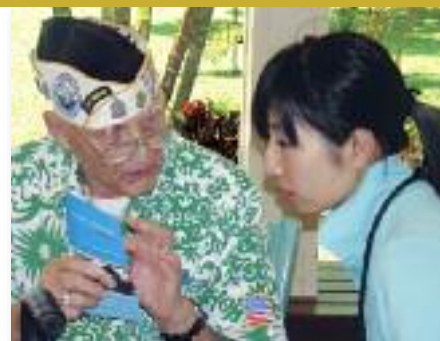
A Pearl Harbor survivor exchanges perceptions of history with a Japanese teacher during the AsiaPacificEd Pearl Harbor workshop.

In support of a USAID initiative, the ASEAN Curriculum Assessment Project evaluated school textbooks used by member states and recommended materials to advance ASEAN awareness and identity-building goals.