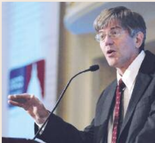
Deputy Secretary of State James B. Steinberg

The survey of opinion leaders from 25 Asia Pacific economies was conducted in April 2009 and is part of PECC’s State of the Region Report. Respondents overwhelmingly agreed that slower growth in Western industrialized countries for the foreseeable future would encourage a shift to domestic demand growth in Asian economies.