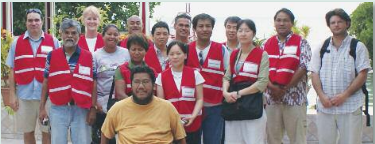
The election observation team members and institutional collaborators.

The Election Observation Mission was conducted under the auspices of the Asia Pacific Democracy Partnership, a multilateral collaboration of Asia Pacific countries to promote and strengthen democratic processes in the region. The East-West Center coordinated the project through a grant from the U.S. Department of State's Bureau of Democracy, Human Rights and Labor. ♦