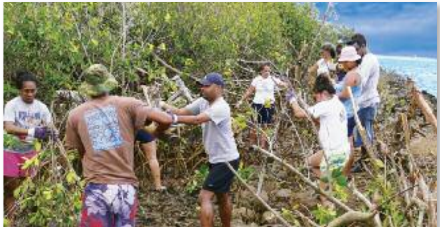
U.S.-South Pacific Scholarship Program alumni helped restore a Native Hawaiian fishpond during their week-long leadership and social networking workshop in Honolulu.

In FY2009 the number of EWC students rose to 540, the highest since 1974. This was driven by a growing variety of public and private scholarship funding streams, with total of 14 at present, including the first from the Norway Research Council, supporting Pacific islands students, and the Ministry of Education and Training in Vietnam. An increasing number of students also fund