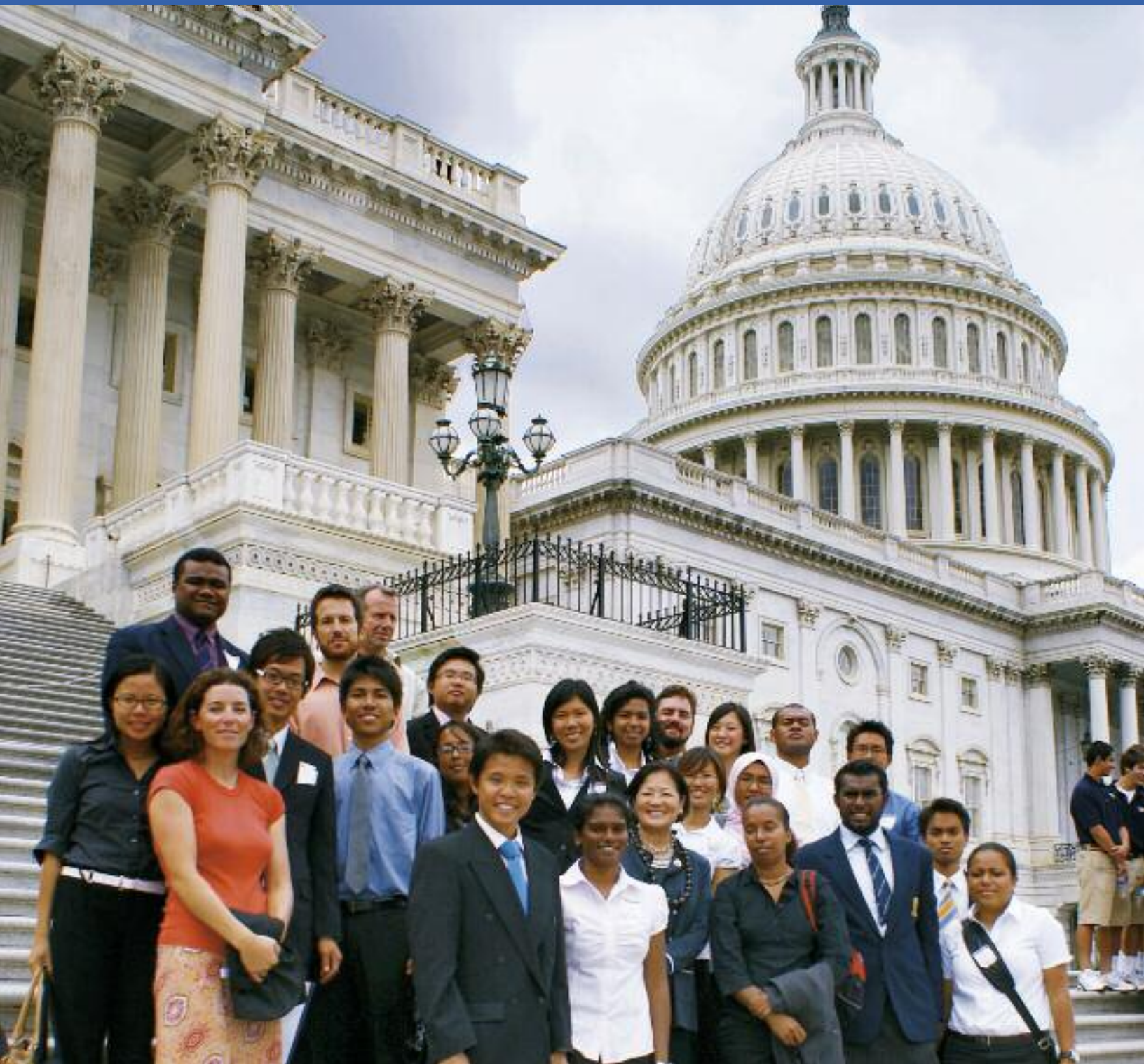
USIE participants with Hawai'i Congressional Representative Mazie Hirono on Capitol Hill.