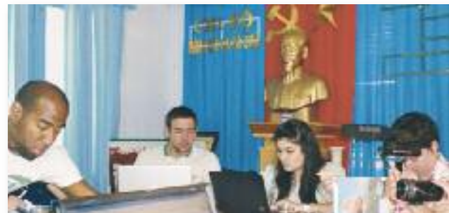
APLP team members collaborating with leaders from the Vietnam Institute of Tropical Biology on a cultural and ecotourism development project involving the Raglay Minority Peoples in Nui Chua National Park.