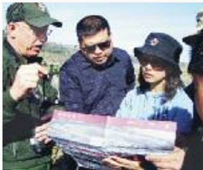
Participants in the China Protected Areas Leadership Alliance Project discuss conservation strategies with a U.S. park ranger.

The Senior Journalists Seminar “Bridging Gaps between the United States and the Muslim World” included the first EWC media program participant from Iran.