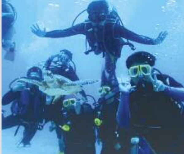
USIE participants look at Hawai‘i’s marine ecology issues first-hand during a deep sea dive.

During the field study in Washington D.C., following a week meeting with scientists and environmental leaders in the San Francisco area, participants examined how effective policies tested by individual states are then adopted at the national level. While in the capital, participants met with members of U.S. Congress leading environmental committees that create policies, officials who enforce the policies at the U.S. Environmental Protection Agency, and professionals who defend or challenge policies at the Natural Resources Defense Council.