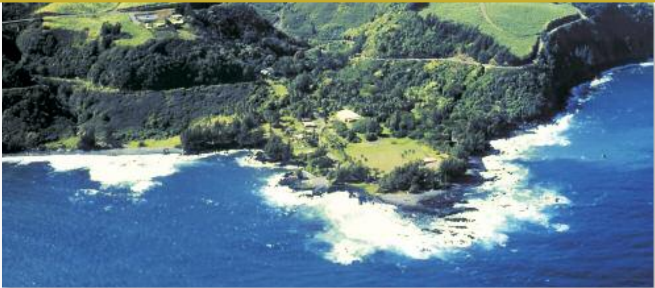
Sea level rise will exacerbate erosion and other coastal hazards, threaten vital infrastructure, and thus compromise the well-being of island communities. The Pacific RISA program provides critical support to Pacific island communities in mitigating and adapting to the effects of climate change.