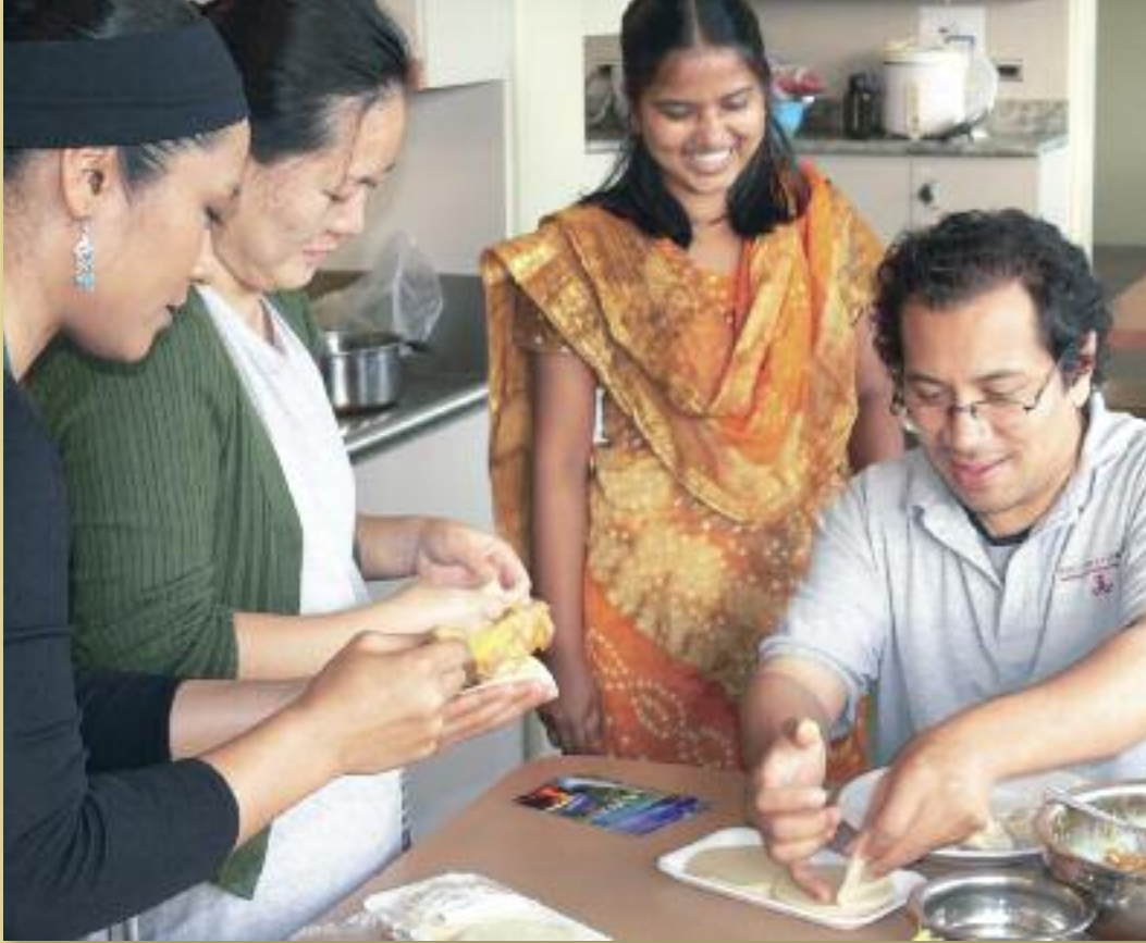
EWC student fellows share cross-cultural culinary traditions in the Center's Hale Manoa residence hall.

The East-West Center promotes better relations and understanding among the people and nations of the United States, Asia, and the Pacific through cooperative study, research, and dialogue. Established by the U.S. Congress in 1960, the Center serves as a resource for information and analysis on critical issues of common concern, bringing people together to exchange views, build expertise, and develop policy options.