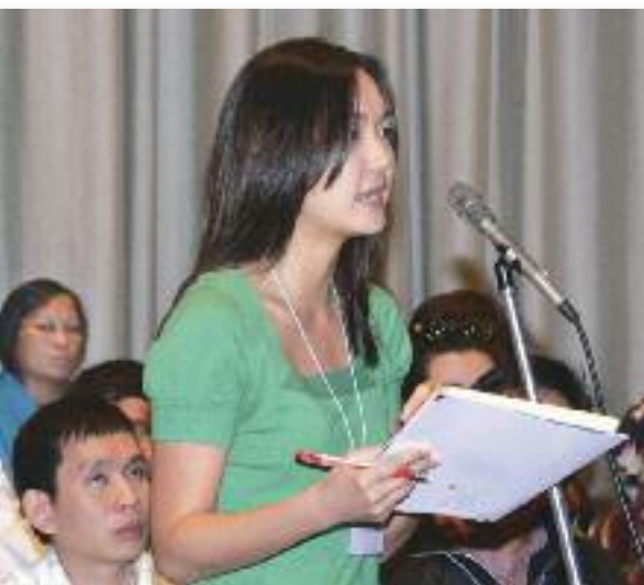
The International Graduate Student Conference, an annual student-led initiative and the largest of its kind worldwide, attracted 140 students from 54 universities in 25 nations.

In partnership with the national accreditation body in Malaysia (MQA), the 7th IFE 2020 Senior Seminar , held in Kuala Lumpur, Malaysia, addressed "Quality Issues for Higher Education in an Emerging Knowledge Society." The insights from these Northeast, South, and Southeast Asian contributors will be published as an edited volume in late 2010.