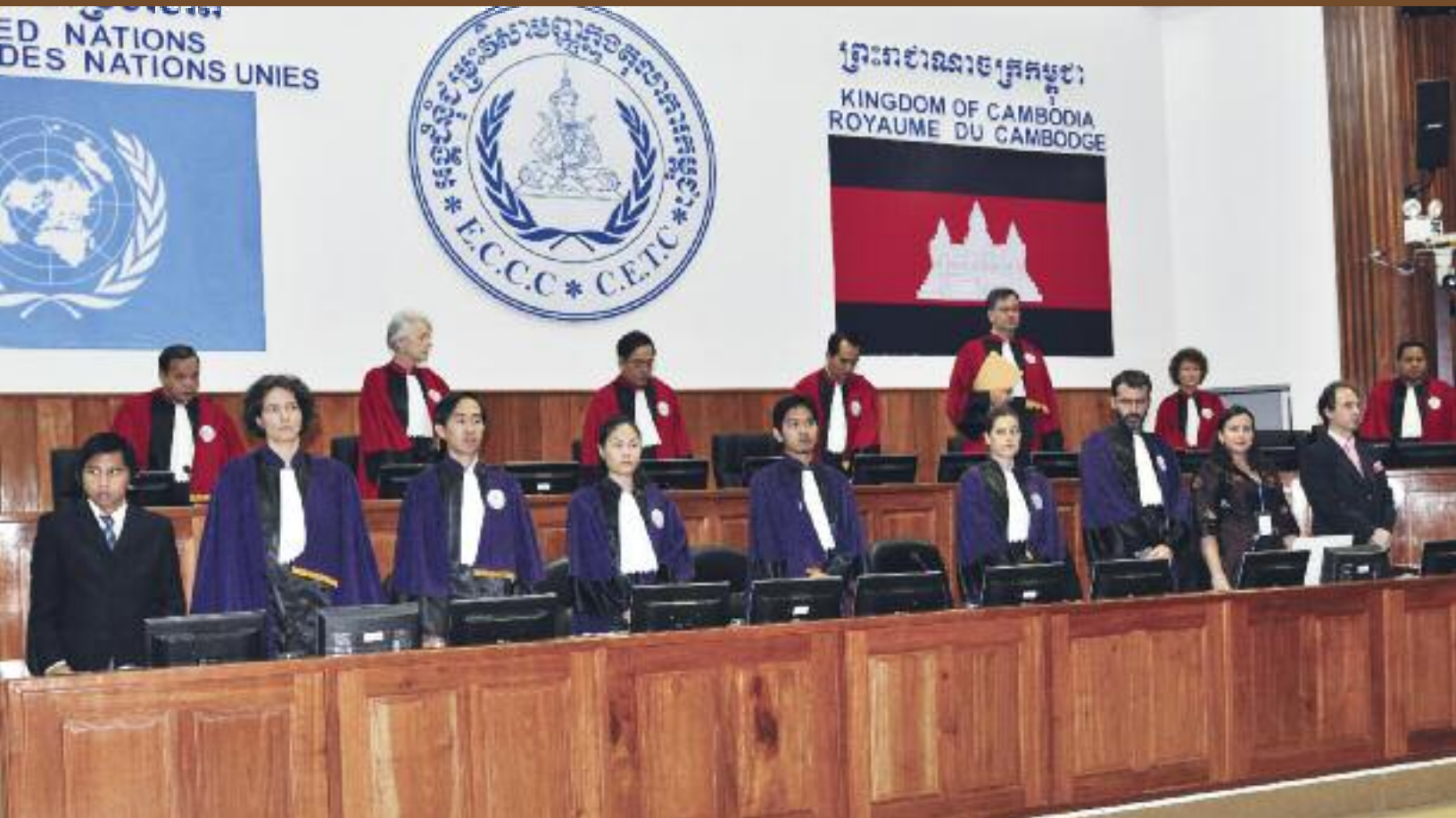
Above: The international panel of judges of the Extraordinary Chambers in the Courts of Cambodia (ECCC), many of whom received pre-trial training through AIJI's programs.