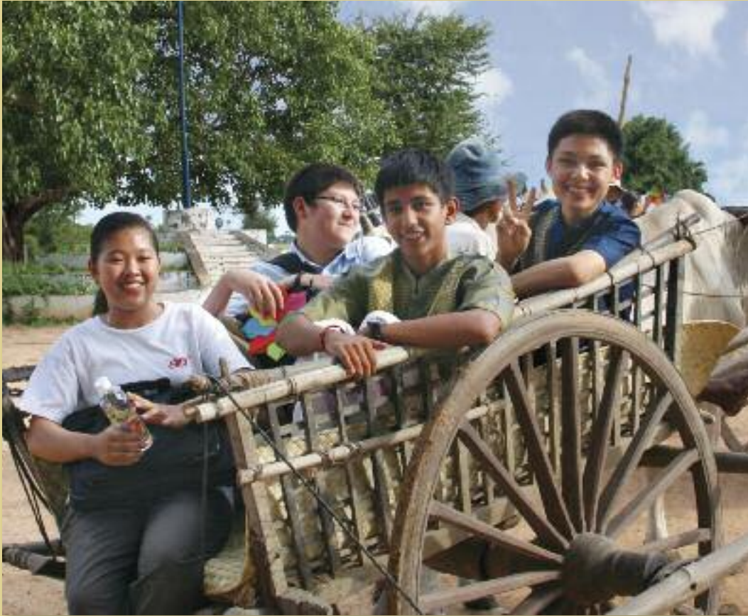
American high school students in AsiaPacificEd's Partnership for Youth (P4Y) program experience daily life in rural Cambodia.